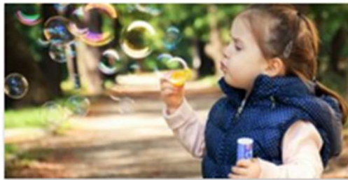
Daycare facility places