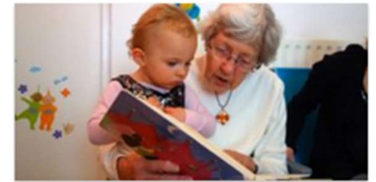
Emergency care programmes