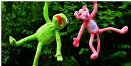
Conference care service