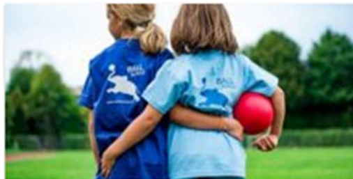
Holiday childcare programme