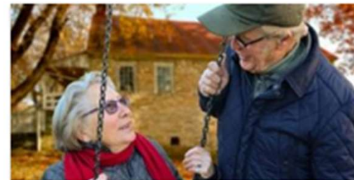
Caring for relatives